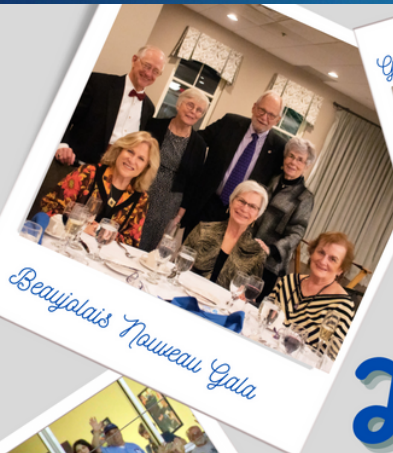
Beaujolais Nouveau Gala