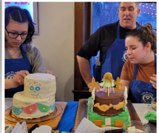
Fleur Délices Challenge